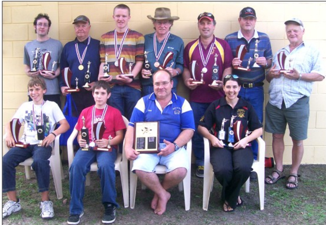
Winners at the Qld Prone Silhouette Championships