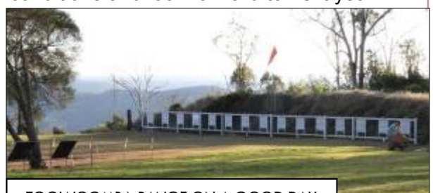
TOOWOOMBA RANGE ON A GOOD DAY