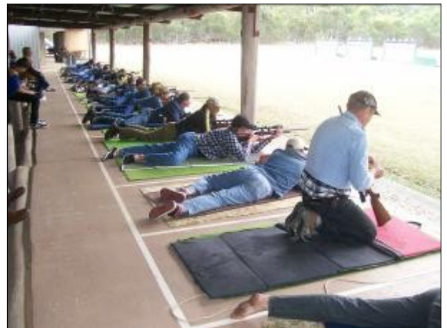
B Detail settles in at the Isis Range