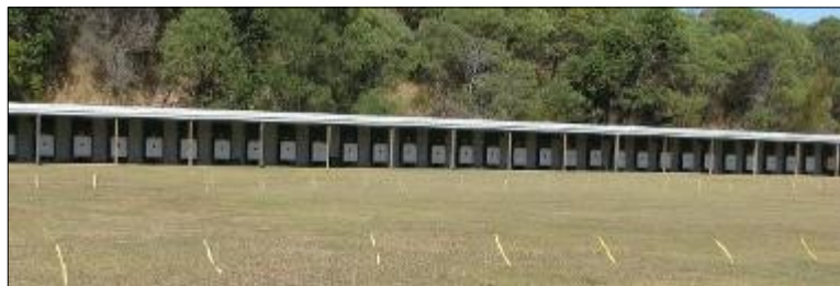
HOW THE RANGE NOW LOOKS WITH ALL TARGETS INSTALLED

All results and photos can be found on the A.I.S.L. website & T.R.A. E-Mag.