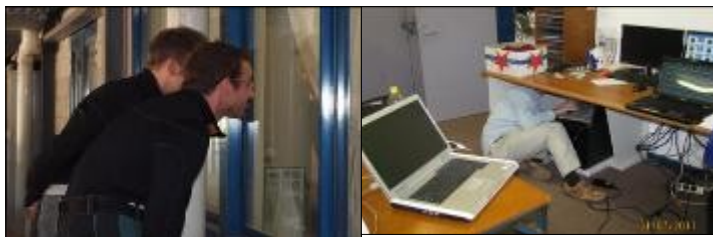
SO THAT'S WHAT GOES ON IN THERE