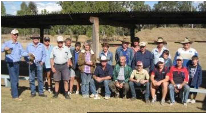
THE MOB AT THE MUG